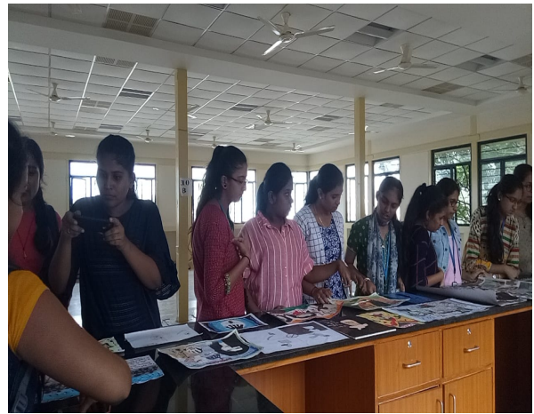
Participants of Painting and Collage competition with the student president and members of Anti Sexual Harassment Cell.